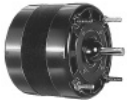
305, 484, 781 (Jenn Air)