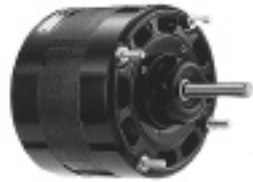
44, 46, 48, 50, 472