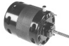
(Tuttle & Bailey) 394 Internal Fan