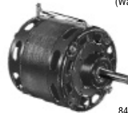
84, 85, 309