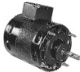
78 Internal Fan (Jenn Air)