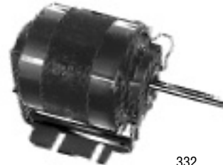
332 TE (Wagner)