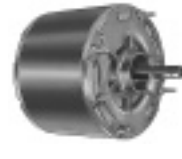
153 TE (Johnson)