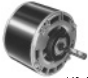
146, 480, 481, 494, 495, 687 (Duo Therm)